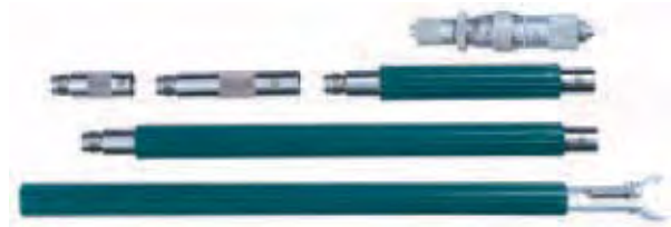
MICROMETER SET - M130